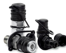
1500 Bar Couplings