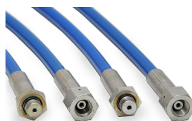
1500 Bar Hose